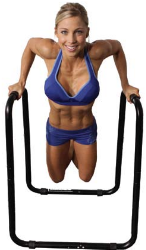
Ultimate Body Press is a leading provider of innovative and affordable home exercise equipment.